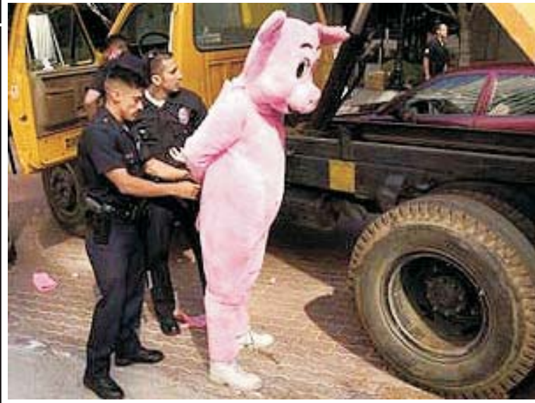
Don't let this be you! All this poor Ham did was forget to renew his FARC Dues.