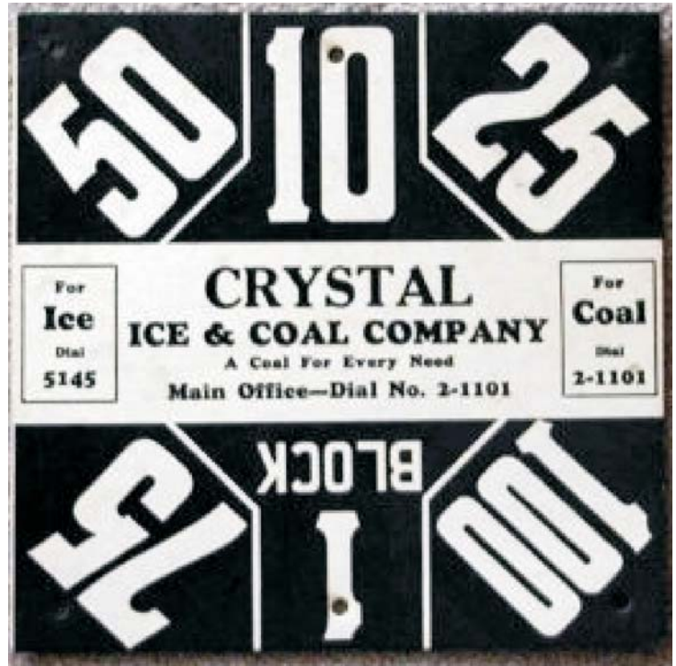
An antique ice card from Winston-Salem's Crystal Ice and Coal Company. Note the holes over the numbers for hanging on a nail and the “quaint” phone numbers.

Item number: 7102268874 sold for $5.00: “Ice cards were widely used throughout the United States, but since they were cardboard they are rarely found in good shape. Crystal's cards are a little unusual in that they are printed on a coated paper (feels almost like a thin wax coating)