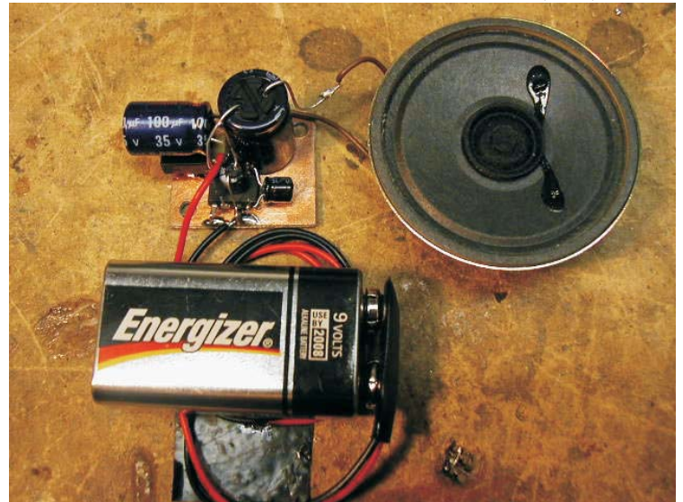
AG4RZ's version of the LM-386 amplifier kit.