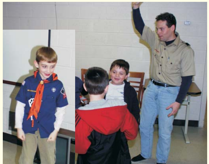
Some of the Cub Scouts that visited W4NC.

We were visited by a gaggle of Cub Scouts just before the February Club meeting. The Cubs held their meeting in room 010 and then took a tour of W4NC. We contacted a station in California and each of the Cubs had a chance to chat on the air.