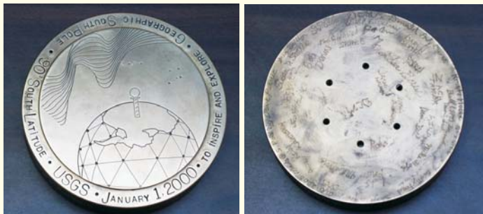
Front and back of the replica of the brass marker that was placed on the South Pole in 2000. On the back side are the signatures of those who wintered-over that season..

A select few are allowed to winter-over at the pole. The main purpose is for research. David was one of those few, and lived a ham's dream working with the communications systems. But if something goes wrong there isn't really a way out. During the winter this may be one of most isolated places on earth. It certainly is one of the coldest. A rare and hot summer day is about 7 degrees F, that's MINUS 13 degrees C. Average is about MINUS 57-degrees F. One advantage for a ham though is that it is easy to determine which way is north.