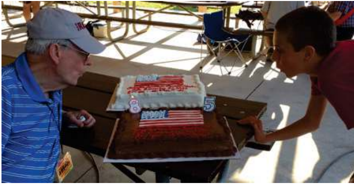
WB4QIZ AND KK4SII, "Doc" and Mason, one of our more, um, experienced, members and one of our younger members blow out the candles on one of the birthday cakes at Field Day.